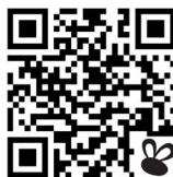
Digital Field Collection Form