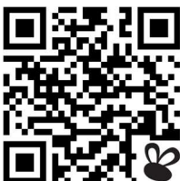
Digital Field Collection Form